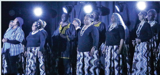
Singers perform a group number in "God's Trombones".

GCCF funding provided support to secure highly skilled musicians and a professional sound and lighting company, both of which are vital to a quality musical theatre production.