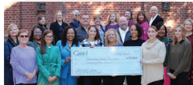
Pictured are representatives of our recipient organizations and members of GWC's Advisory Board and Grants Review & Awards Committee.

Staff training and salaries for family planning counseling and access to contraceptives at Greenwood County clinics