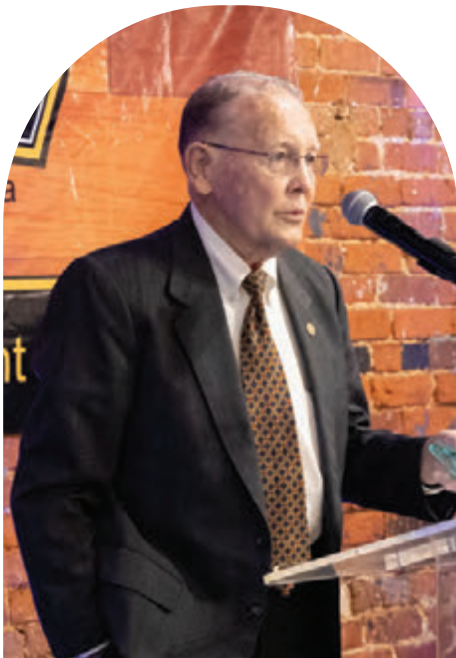
Parham award cut line