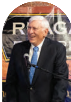
Spirit of Philanthropy

The Greenwood County Community Foundation (GCCF) held its fifth Awards Gala on Tuesday, May 2nd at Greenwood's Inn on the square, celebrating those individuals who seek to make a philanthropic or altruistic difference in their community.